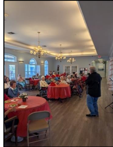
Charter Resident Group