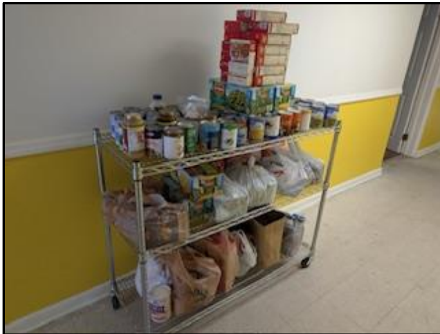
Christmas Basket Collections