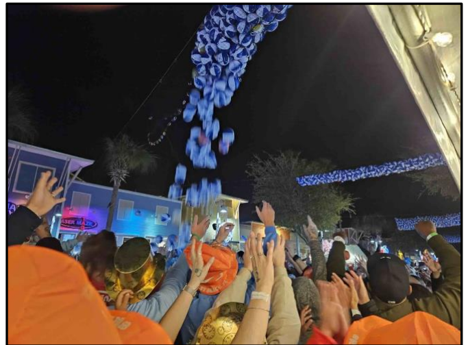
New Year's Eve Beach Balls Drop

Happy New Year!! The Special Beach Events celebrated New Year's Eve with over 40,000 party goers at Pier Park and Aaron Bessant Park. And let's just say, PCB knows how to throw a party! The kids area in Aaron Bessant was a new addition this year with kids activities and games, a bounce house, a light show, food trucks, fireworks, a beach ball drop and of course, PARTY HATS! Pier Park had live music, a beach ball drop at 8pm, fireworks, PARTY HATS, stilt walkers, the Pier Park Beach Ball mascot and the big ball drop at midnight. We were constantly busy and having fun with the hat distribution. But more importantly this was a bigger and better opportunity for the WCC of PCB to earn funds that will be donated to our PCB charities and support organizations!! We cannot express our sincere gratitude and appreciation of the ladies, as well as their family and friends, that joined us for this fundraiser! You were a pleasure to work with and truly represented the club's motto of Uniting for a Better Community!